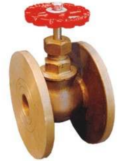
ITEM CODE # GM - 507