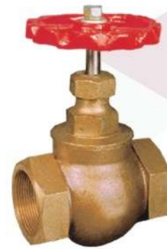
ITEM CODE # GM - 506

Screwed in bonnet, Inside screw with S.S. working parts Rising Stem with back seat arrangement, Hand Wheel operated.